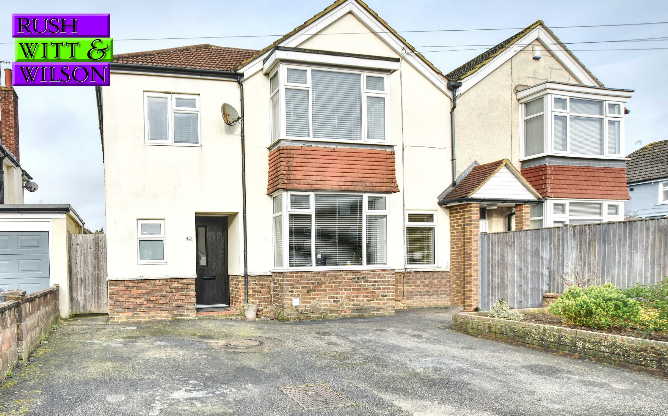
110 Turkey Road, Bexhill-On-Sea, East Sussex TN39 5HE Guide Price £420,000